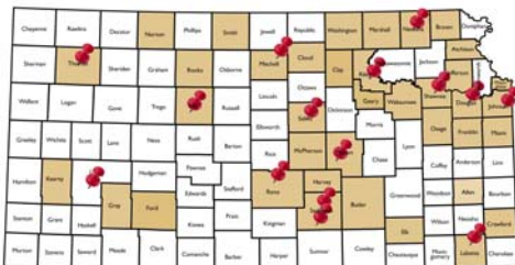
Map of Participation for the Early Childhood Distance Learning Event, June 3, 2009

Counties where individuals will be participating are indicated in tan. Videoconference locations are indicated with a red push pin.